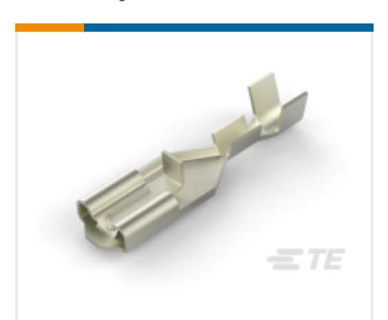
TE Part # 170330-2 PL 187 RECEPTACLE 24-20 AWG NPPHBZ