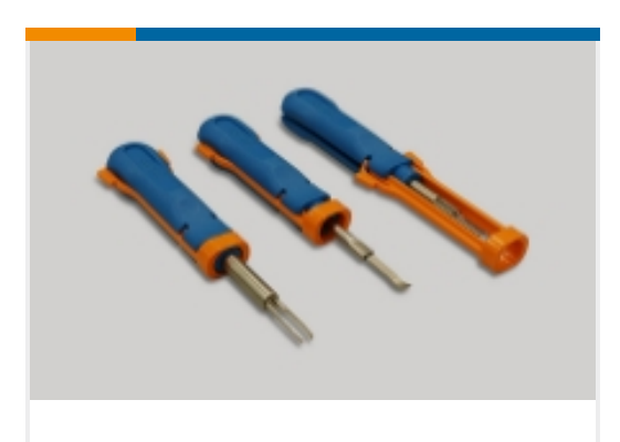
Insertion & Extraction Tools(2)