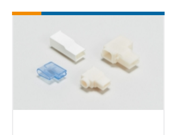
Crimp Terminal Housings(87)