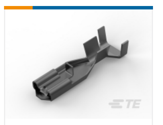
TE Part # 170332-1 PL 187 RECEPTACLE 18-14 AWG PTPBR