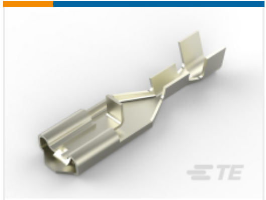
TE Part # 170324-2 PL 187 RECEPTACLE 24-20 AWG 0.3 NPCU